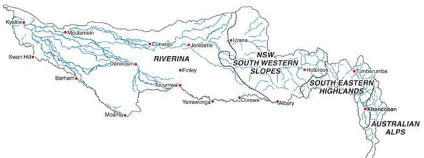
FIGURE 2. Major towns and bioregions of the Murray Catchment Management Area, New South Wales, south-eastern Australia.

For the granite outcrop sites, reptiles were actively sought behind bark, within rock crevices, and beneath fallen timber, surface rocks and leaf litter within a 4 ha search area (200 m x 200 m). Field ecologists from The Australian National University completed each survey (DM, MC, RMD, CM and LM). In the Riverina, sites were surveyed during October 2008 and August 2009. In the SWS, remnants and planting sites were surveyed during August 2003 and November 2002, 2003, 2005 and 2008. Granite outcrops were surveyed between October 2006 and February 2007, and surveys on Nail Can Hill Flora and Fauna Reserve were conducted annually between 1997 and 2009 by DM for comparison. All surveys were conducted between 09:00h - 16:00h on clear days with minimal wind. Surveys were conducted under the Department of Environment and Climate Change scientific license number S12604.