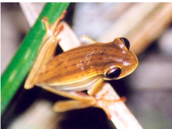
Figure 1. Adult male of Hypsiboas beckeri from the municipality of São Thomé das Letras, state of Minas Gerais, southeastern Brazil.

Hypsiboas beckeri (Figure 1) is a small tree frog (mean SVL 29 mm in males and 33 mm in females) described by Caramaschi and Cruz (2004). This species is known from the type locality: Morro do Ferro (ca. 20°46'00.25" S, 44°35'00.00" W; 1,200 m), municipality of Poços de Caldas (Caramaschi and Cruz 2004) and from the Serra da Pedra Branca (22°11'16.1" S, 45°23'23.5" W), municipality of Pedralva (Orrico and Luna-Dias Neto 2006), both in the state of Minas Gerais, southeastern Brazil. Data on the ecology and natural history of Hypsiboas beckeri is scarce and, therefore, it is considered data deficient by the IUCN list (Stuart 2006).