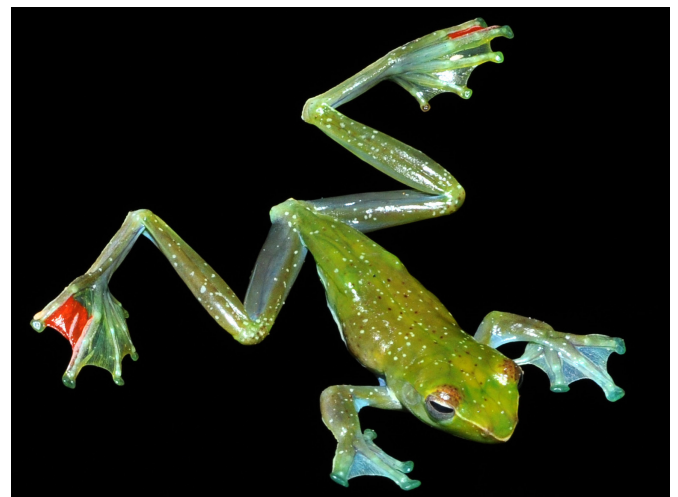
FIGURE 2. Female Rhacophorus dulitensis (NMBE 1056708) from Kubah National Park, Sarawak, Malaysia (western Borneo).