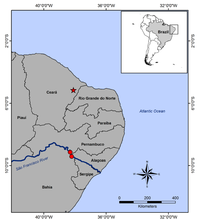
FIGURE 1. Distribution of Chthonerpeton arii . Star = type locality, municipality of Limoeiro do Norte, state of Ceará, Brazil; upper circle = UHE Itaparica, border between states of Bahia and Pernambuco, Brazil (approx. 09° 08' S; 38° 18' W; 270 m elev.); lower circle = municipality of Paulo Afonso, state of Bahia, Brazil (approx. 09° 22' S; 38° 13' W; 235 m elev.).

distribution in Brazil, occurring in water bodies in the Caatinga biome: temporary ponds at the type locality; in a river and in a fish breeding station in our new locality records. Collection of more specimens will be needed to improve the knowledge of it species.