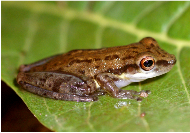
FIGURE 1. Adult male of Scinax agilis collected in the municipality of Areia Branca, state of Sergipe, Brazil (ZUEC 17842).