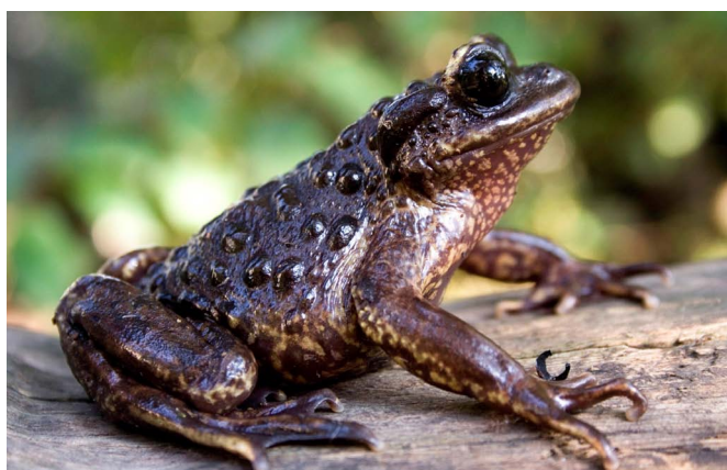
FIGURE 2. Adults of Telmatobufo bullocki from Los Queules National Reserve, Maule Region, Chile. Top) October 2006, Bottom) May 2007.

A fragment of the mitochondrial gene 16S was sequenced and compared with sequences of the genus available in GenBank. Primers and PCR protocol are detailed in Correa et al. (2006). A segment of 483 pair of bases was obtained and deposited in GenBank (accession number GQ994987). Analysis of an alignment of 479 sites (segments with indels were excluded) reveals a 1.04 % difference with T. bullocki found in Caramávida, Nahuelbuta range (accession number DQ864565), and 3.55 % with T. venustus , of Altos de Vilches (accession number DQ864566). Although we have no more intraspecific genetic data for these species, the higher divergence between T. bullocki and T. venustus , along with the morphological characters, allow us to confirm the specific identity of the specimen from Los Queules.