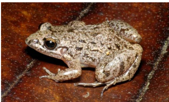
FIGURE 1. Male Leptodactylus thomei (CFBH 22295) collected at Mimoso do Sul, southern Espírito Santo.

The Leptodactylus marmoratus species group (formerly the genus Adenomera ) is taxonomically controversial; some cryptic species can be recognized only by behavioral aspects, such as call structure, genes, reproductive mode and natural history (Angulo et al. 2003; Almeida and Angulo 2006); recent studies encompassing advertisement calls revealed several cryptic species (Kwet and Angulo 2002; Angulo and Icochea 2003; Angulo et al. 2003; Kokubum and Giaretta 2005; Boistel et al. 2006; Almeida and Angulo 2006; Berneck et al. 2008; Angulo and Reichle 2008). Additionally, actual species diversity in the group is far greater than what is currently recognized (Angulo et al. 2003; Kokubum and Giaretta 2005; Angulo and Reichle 2008).