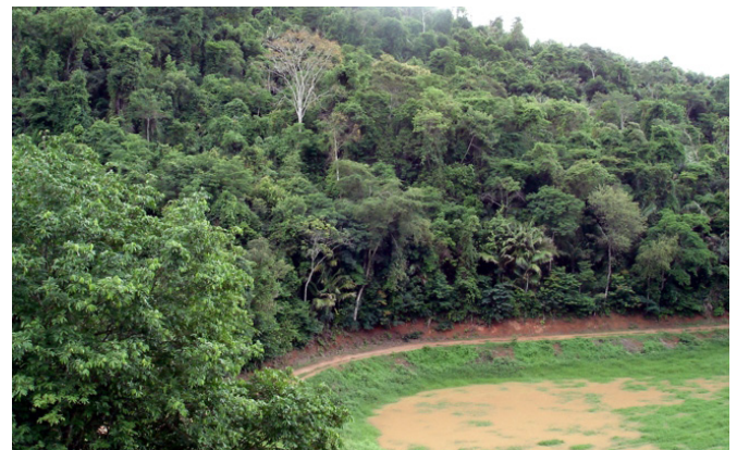
FIGURE 2. General view of the site where Leptodactylus thomei was collected at Mimoso do Sul.

Leptodactylus thomei Almeida and Angulo, 2006 is a recently described species of the L. marmoratus group, only known from the northern region of the state of Espírito Santo. The type locality (Povoação, Linhares, 19°33' S, 39°46' W) is located in cocoa plantations within alluvial forests, at sea level (Almeida and Angulo, 2006). In addition, the original species description reports one specimen heard and collected at Governador Lindemberg,