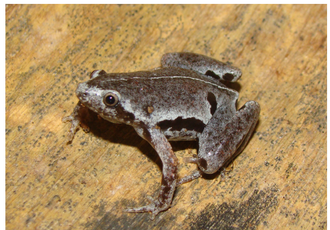
FIGURE 1. Lateral view of a Chiasmocleis superciliarbus , found at Extractive Reserve Chico Mendes, Acre, Brazil.

During fieldwork in the Reserva Extrativista Chico Mendes, Brasiléia, State of Acre, Brazil (10°45'05" S, 69°18'15" W) we collected three individuals of C. superciliarbus . Fieldwork was conducted in the months of October 2011, December 2011, and January 2012. Specimens were captured in pitfall traps placed in culture plantations of cupuaçu ( Theobroma grandiflorum ), pupunha ( Bactris spp.) and rubber trees ( Hevea brasiliensis ), at "Seringal Etelvi". Specimens were killed and fixed in accordance with guidelines of the American Society of Ichthyologists and Herpetologists and were deposited in the Coleção de Herpetologia da Universidade Federal do Acre, Campus Floresta in Cruzeiro do Sul, Acre, Brazil (UFACF 4082, 4083 and 4084). Permit number 25261-1 System Biodiversity Information and Authorization - SISBIO - Instituto Chico Mendes de Conservação da Biodiversidade (ICMBio).