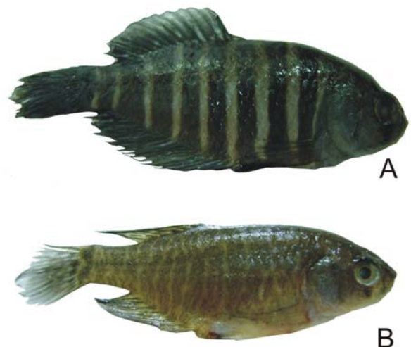
Figure 1. Male (A) and female (B) of Austrolebias minuano collected at Talha Mar locality at Lagoa do Peixe National Park, state of Rio Grande do Sul.