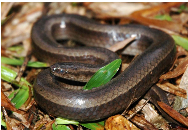
FIGURE 1. Specimen of Brazilian burrowing snake, Gomesophis brasiliensis, captured in Vargem Bonita, state of Santa Catarina, Brazil.