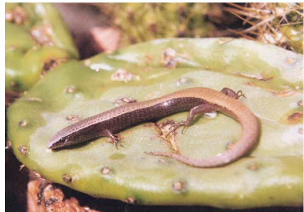
Figure 1. Psilophthalmus paeminosus collected at Fazenda Cana Brava (09°34'39" S, 37°59'12" W), in the municipality of Canindé do São Francisco, state of Sergipe, Brazil.

Psilophthalmus paeminosus Rodrigues, 1991 (Figure 1), the only species of this genus, is among the species of the Gymnophthalmidae described from these dunes. The species is found only on the right bank of the middle São Francisco, where it has been recorded in the municipalities of Santo Inácio (type locality) and Vacaria (Rodrigues 1991c), in the state of Bahia. These localities, characterized by sandy soils, are relatively isolated and harbor other endemic species of lizards and snakes (Rodrigues 1991a; 1996).