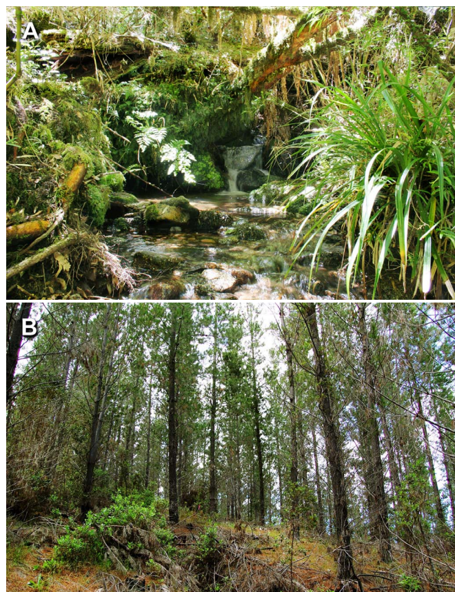
FIGURE 3. The two type of landscapes in the new distribution areas of A. vanzolinii . A) Ravine in small patch of remnant native forest, B) Exotic tree plantations (pine).

The current records provide an important contribution to the knowledge of the real distribution area of A. vanzolinii , one of the most threatened Chilean anuran species due to the habitat destruction and expanding exotic tree plantations. It is highly necessary to increase the effort to further surveys in search of new populations of the species, assessing the conservation status of these and how the plantation managements, like application of herbicides and fertilizers or tree harvest, are affecting them.